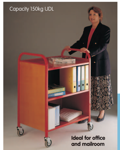
Ideal for office and mailroom

Tubular steel frame with three steel trays. Back and sides infilled with varnished MDF panels. 4 x 100mm swivel castors with grey non-marking tyres and thread guards. Overall L x W x H: 825 x 555 x 1050 mm Shelf L x W: 750 x 500mm Shelf heights: 200; 550; 895mm Total weight: 38kg Red handle Ref: TT20R Green handle Ref: TT20G Yellow handle Ref: TT20Y Blue handle Ref: TT20B