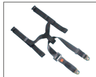
Seat belt system including hip belt